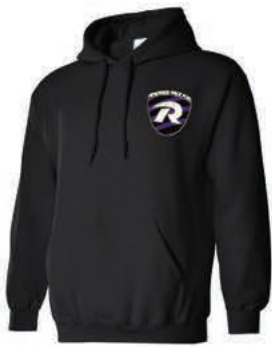
HOODIE // SMALL-3XL