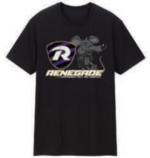
T-SHIRT // SMALL-3XL