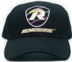
CURVED BILL HAT