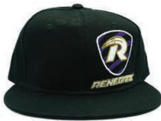
FLAT BILL HAT