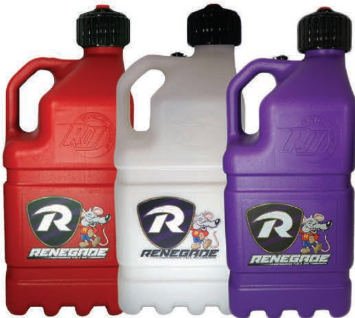
5 GALLON UTILITY JUGS -COLOR SELECTION MAY VARY-