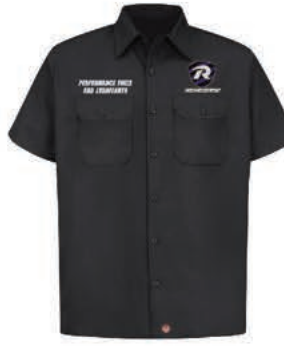
WORKSHIRT // SMALL-3XL